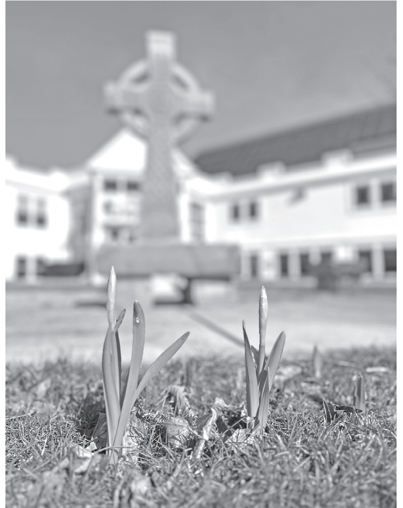
Members of the First Presbyterian Church of Youngstown planted 200 daffodil bulbs around the churchyard in the fall and are awaiting their spring bloom as they celebrate the church's 200th anniversary. The community is invited to join in their celebrations this year.